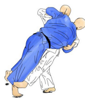
Sasae Tsurikomi Ashi