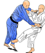
Harai Tsurikomi Ashi